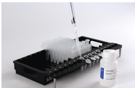
Figure 2. Setup and configuration in the deck tray(s). Nuclease-Free Water is added to the Elution Tubes as indicated.